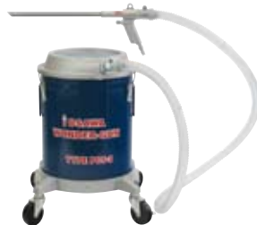
Dust Collector Super PCS-3 (Weight : 7.4kg)