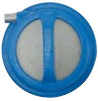
Dust Collector W1-20 (Weight : 6.7kg)