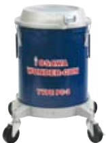
Dust Filter PC-3 (Weight : 6.5kg)