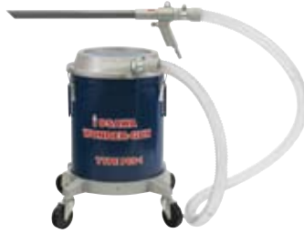
Dust Collector Super PCS-1 (Weight : 7.7kg)