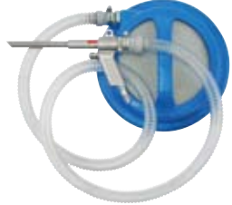
Dust Collector Set W3-20SET (Weight : 7.4kg)