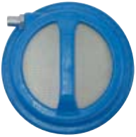
Dust Collector W3-20 (Weight : 6.7kg)