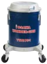
Dust Filter PC-1 (Weight : 6.5kg)

■ Please refer to page(1) for performance chart.